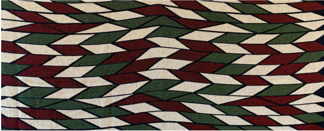
Image used is just a small piece of a beautiful blanket we have in our office. Takaya | Wolf by Debora Sparrow.